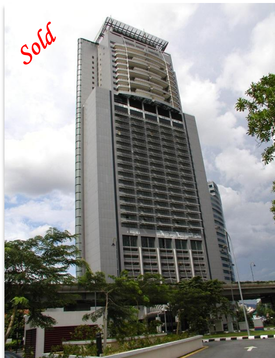
Menara 238, Jalan Tun Razak.

KPJ Healthcare Bhd had entered into a tenancy agreement for Menara 238 in September 2012 with Danaharta Hartanah Sdn Bhd. KPJ plans to move all non-revenue generating services that are occupying KPJ Hospital to the building. Menara 238 formerly known as Menara Marinara and the building was converted into commercial and office use after refurbishment. KPJ is currently occupied 74,750 sq.ft or 15% of the total lettable area.