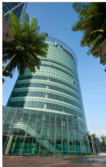
Tropicana City Office Tower, Petaling Jaya

CapitaMalls Malaysia REIT Management Sdn Bhd has decided not to proceed further on its intentions to purchase the Tropicana City Mall and office block in Petaling Jaya from Tropicana Corporation Bhd. CapitaMalls Malaysia Trust (CMMT) and Tropicana Corporation Bhd were unable to agree on the terms of the sale.